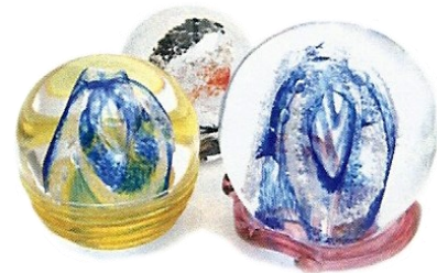
Unique Cremation Offerings